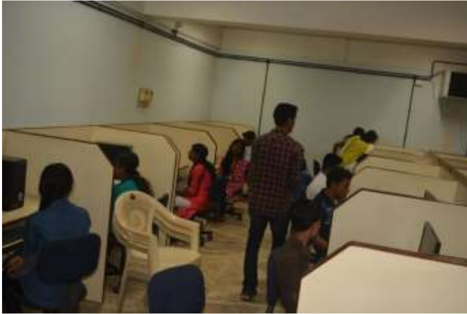
The software for training in 10 computers in the Computer lab