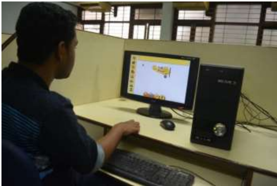
Students equipped to use the IT based education for PWD