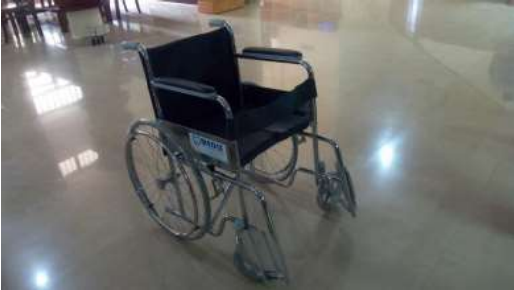
Wheel chairs propelled manually by turning the wheels by the hand for physically disabled students