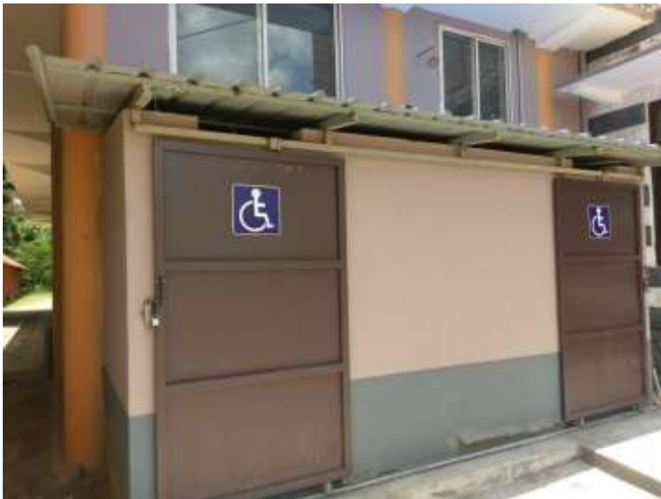
Accessible toilet and changing facilities located in the campus; a wheelchair accessible toilet provided for girls' and boys' toilet separately