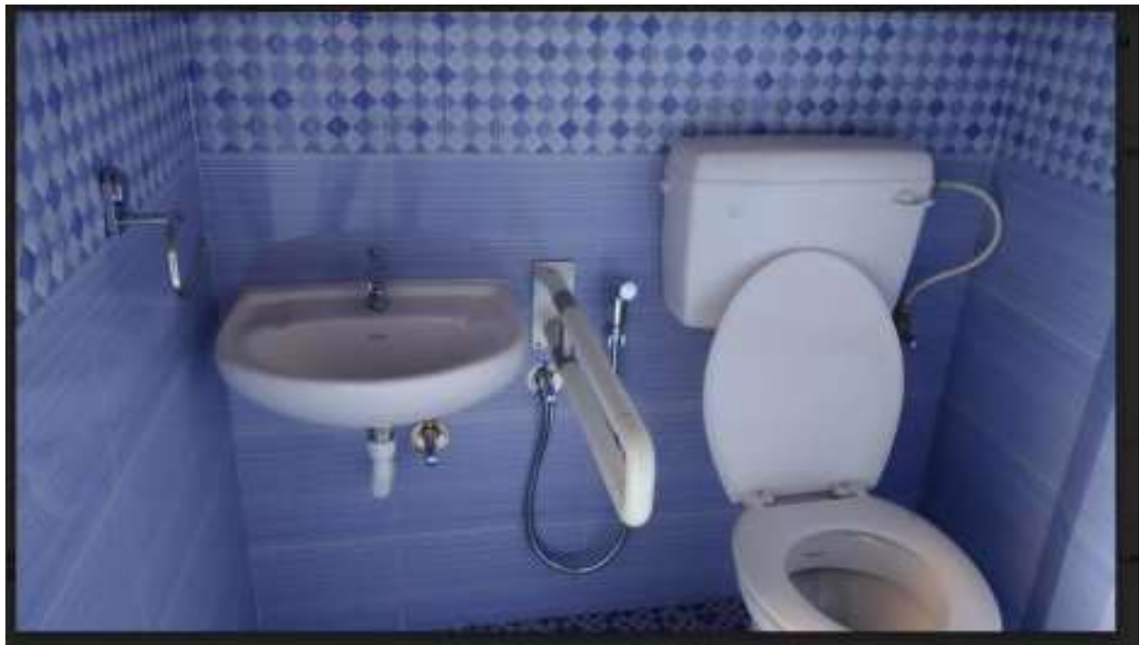
Specially designed hand rest