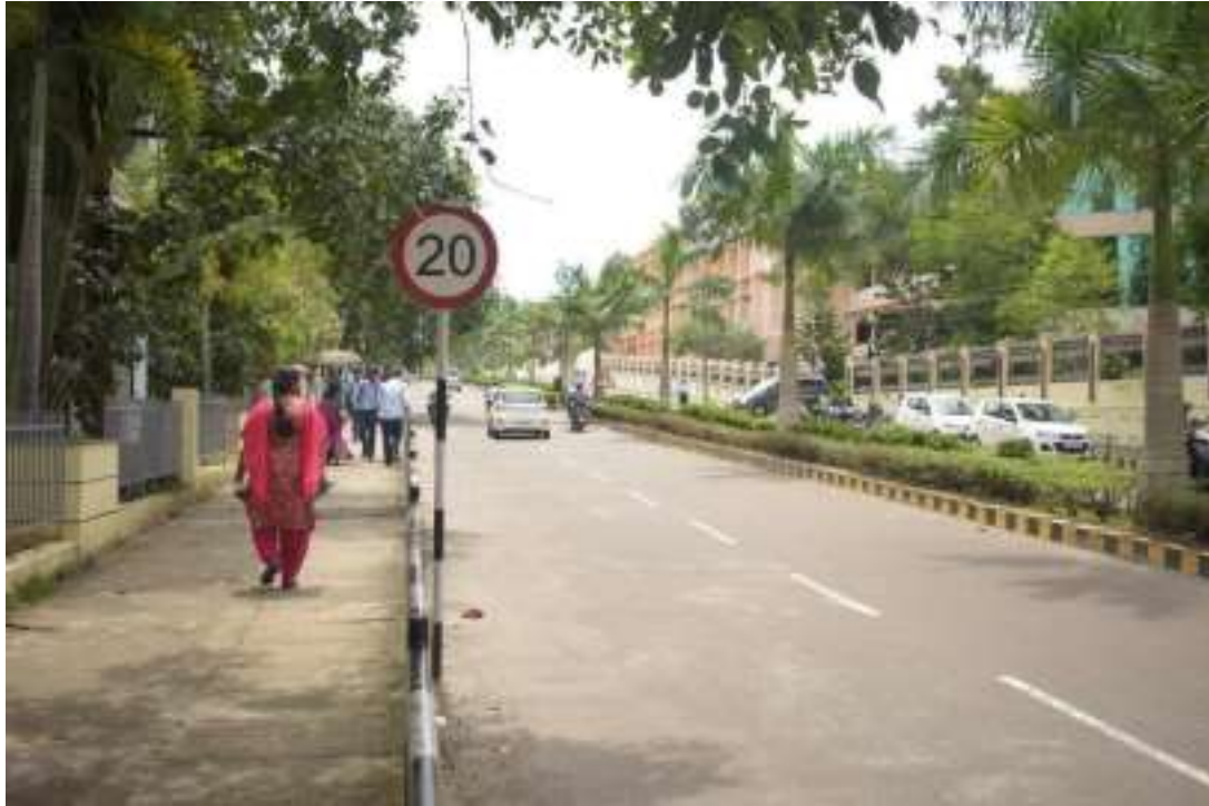
Tarred Road and concrete pedestrian- access to all blocks