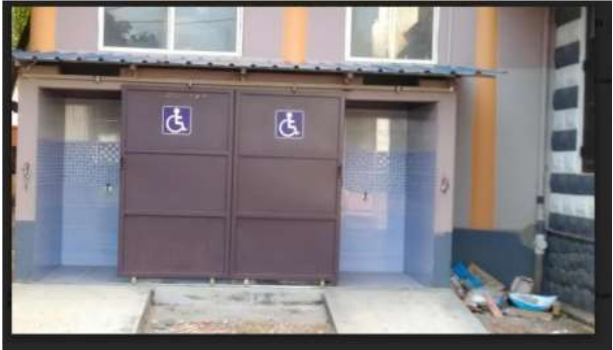
Separate toilet to boys and girls and Ramp access towards the toilets