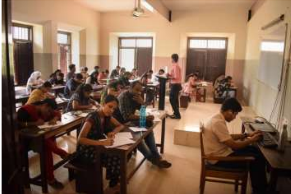
Automatic audio supported Braille Transcription System for Braille reading, writing and printing for Visually Impaired student