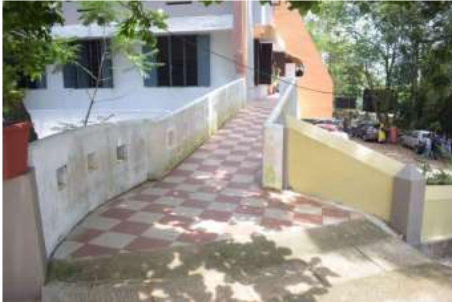
Ramp in different blocks.