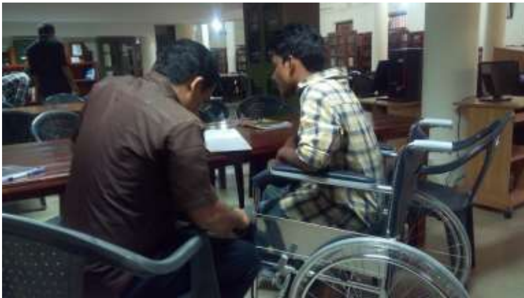
Wheel chair access into the library